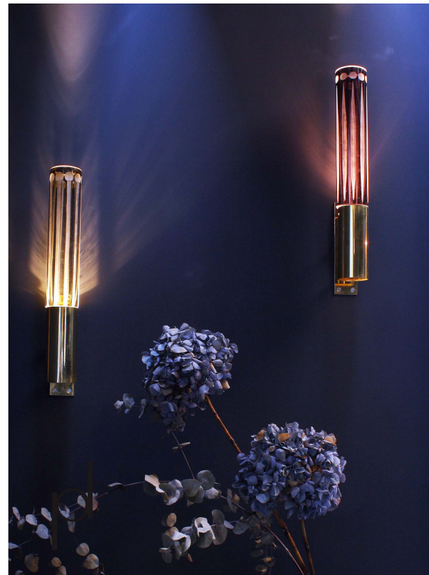
tall size wall-light open at the top Smokey bronze with 10 slashes and dots Aubergine with 10 slashes and dots Brass finish - polished brass.